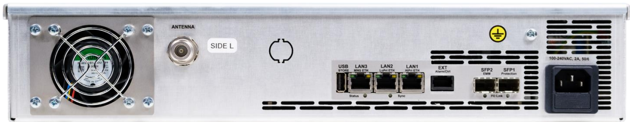
Rear side view